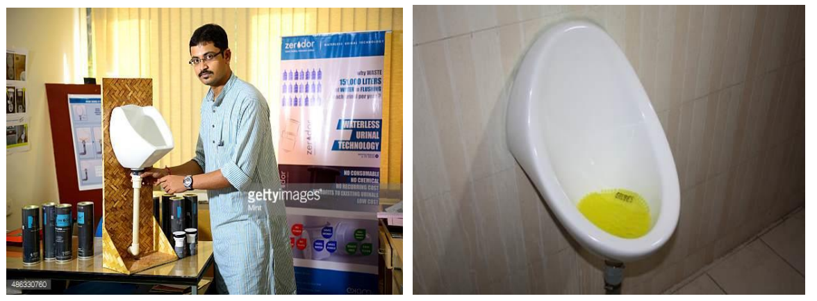
The images above show the actual product Zerodor.

In a typical sanitation value chain like above, the utility of Sewage Care is apparent. It helps in rapid composting of solid waste into a fertility boosting organic by-product. The most crucial aspect is that it helps in closing the Agriculture-Sanitation-Agriculture loop. Waste water is broken down to nutrient rich water and a fertile compost.